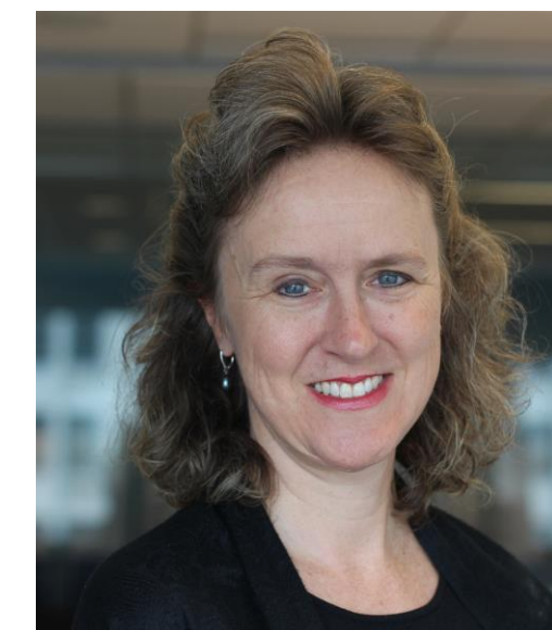
Zarrin Caldwell U.S. Department of State