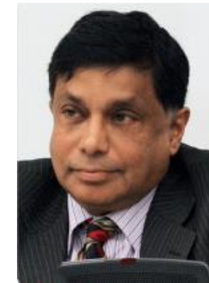
Ramu Damodaran United Nations