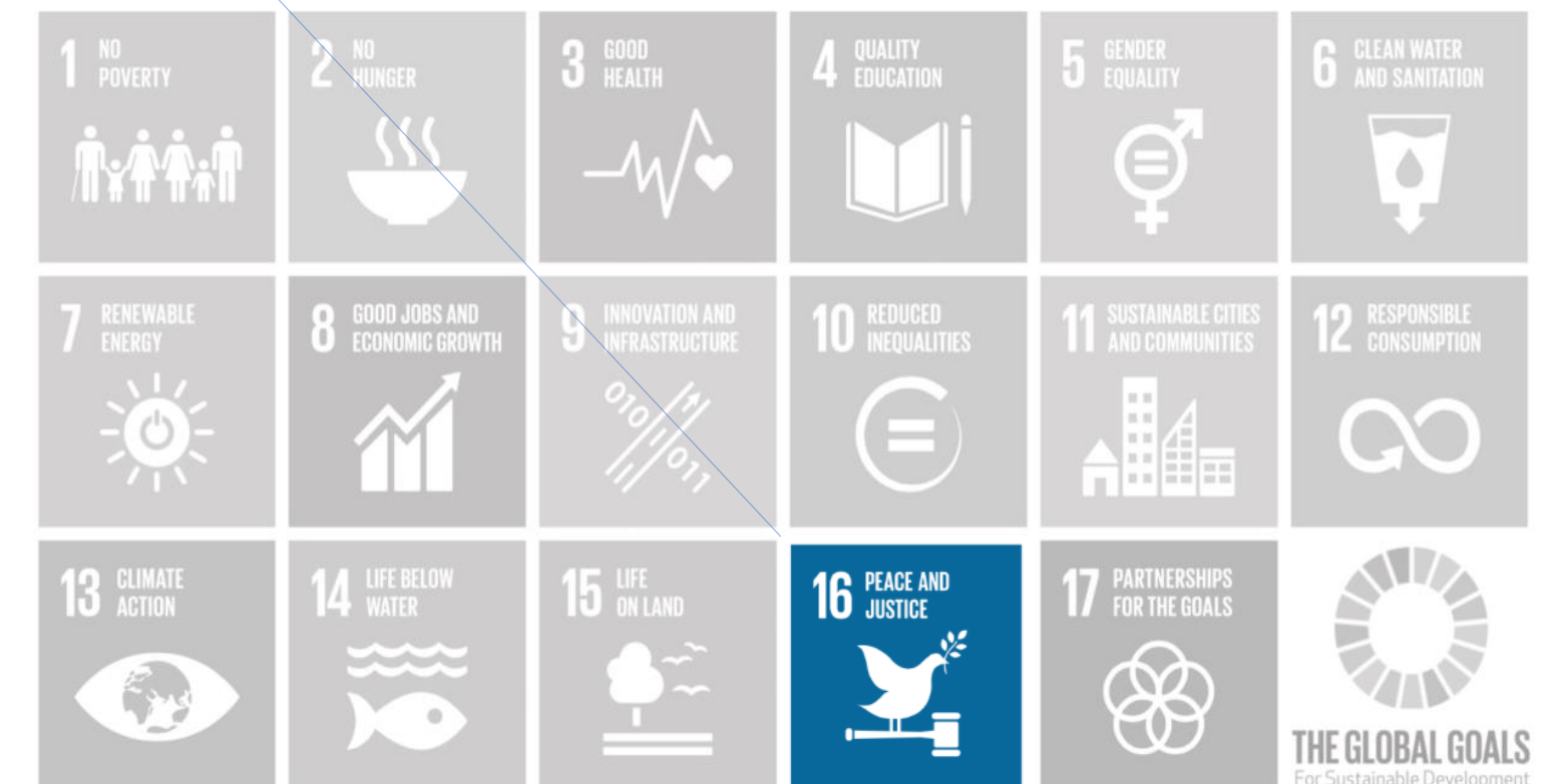
Areas of Focus (The Rotary Foundation)